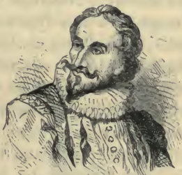
LOPE DE VEGA.

from the regions of fiction, in the very heart of truth." Not content with this appeal through the theatre, Cervantes, with constant zeal, takes up the same theme, in the tale of the Captive, in Don Quixote, as we have already seen, and also in that of El Liberal Amante , The Liberal Lover, and in some parts of La Espanola Inglesa , The English Spanishwoman. All these may be regarded, not merely as literary labors, but as charitable endeavors in behalf of human freedom.